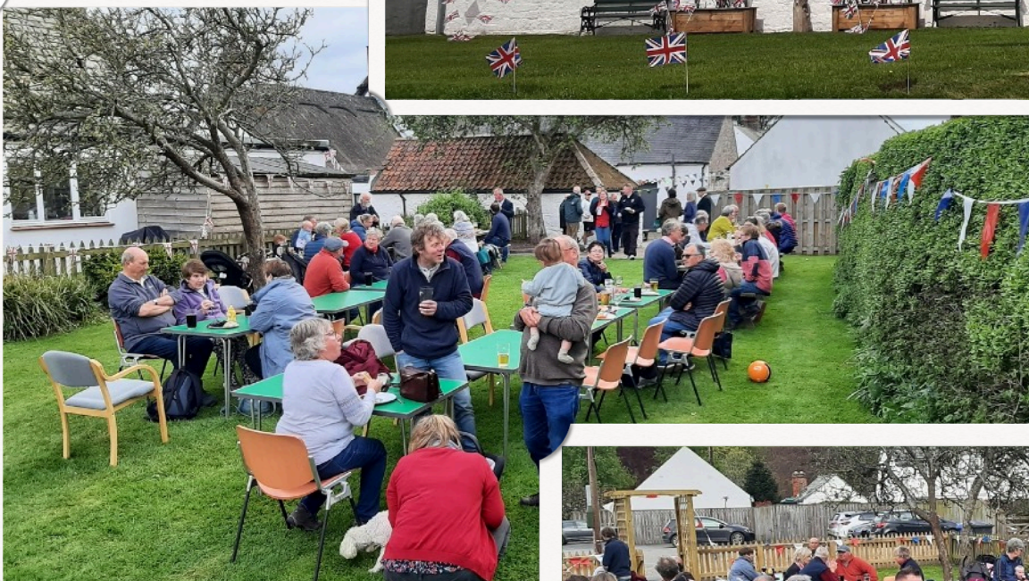
Locals enjoy a barbecue and drinks in the Black Bull garden. The food was sponsored by Etal Village hall.