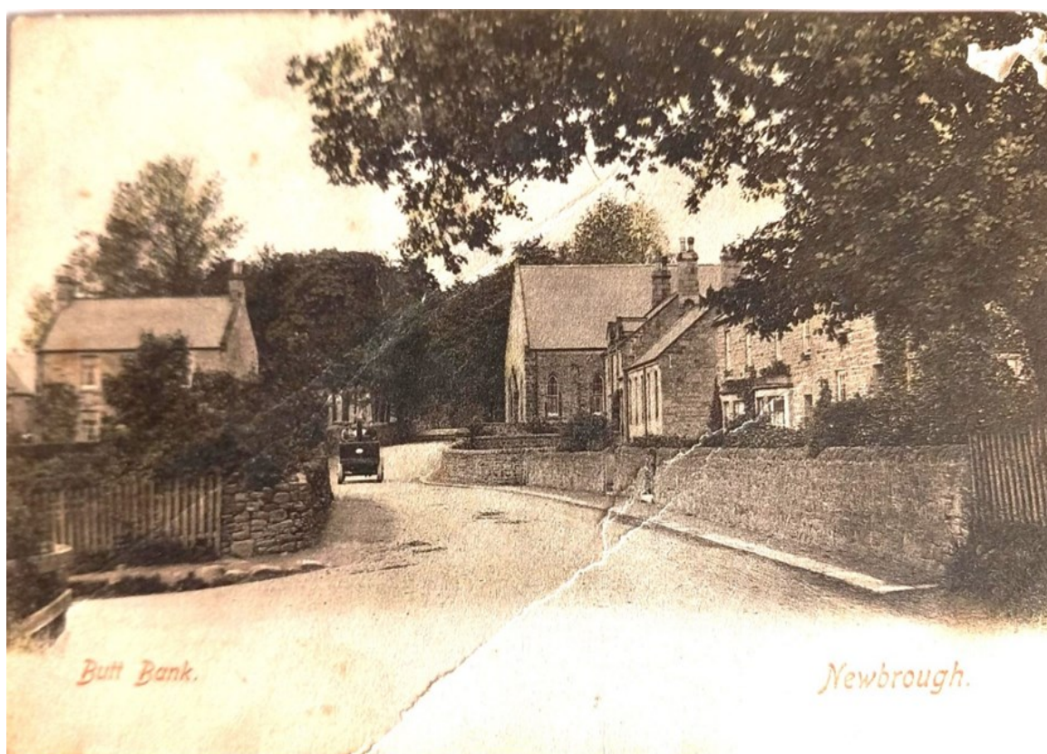
Butt Bank in a postcard dated 1904

Contributions need to reach the editors by the middle of the month for consideration at the Regular editorial meeting in the third week. We hope the item on page 5 will be the first of many contributions.