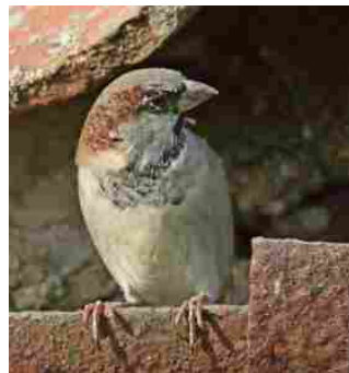
Male House Sparrow

both urban and rural populations over the last 25 years. The males and females have different plumage, note particularly the grey feathers on the