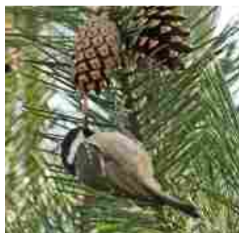
Coal Tit eating seeds from a pine cone

The crown of the head is black with a midline white stripe at the nape of the neck. It has a finer bill, which makes it easier for the bird to get seeds out of cones on conifers. Its behaviour at the feeders is also different, typically flying in, picking up a piece of food then flying off