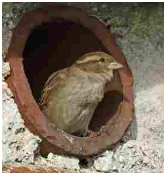
Female House Sparrow

House Sparrows are the commonest, living in noisy gregarious groups and feeding on scraps and seeds. Although plentiful in number locally there is cause for concern as studies have shown a marked decline in