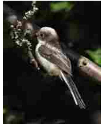
Long Tailed Tit