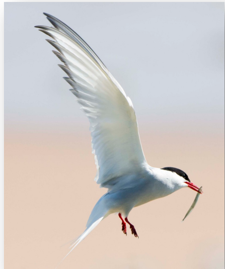
Arctic Tern